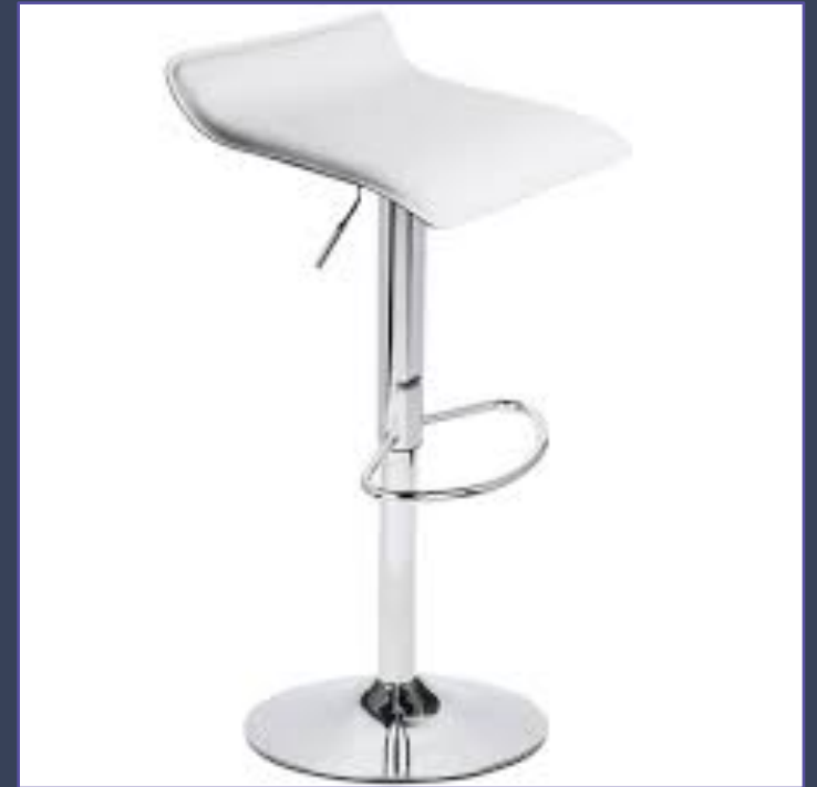
High chair (2 day rental): AED 250 / $ 68.08

*All costs are subject to 5% VAT and final scope