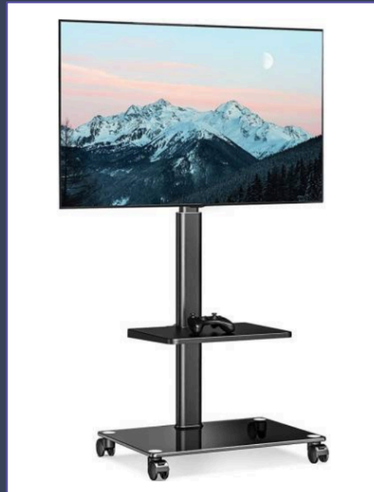
65 Inch Screen on stand (2 day rental): AED 5,500 / $ 1,497.49