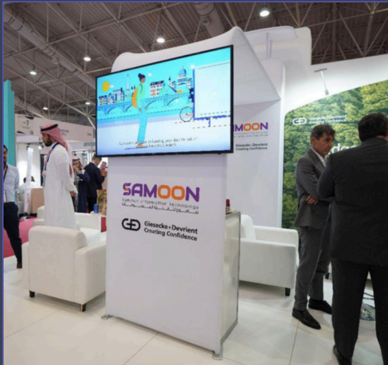
Mounted 55 Inch Screen (2 day rental): AED 2,007.63 / $ 546.67

Alternatively, we also offer LED 65inch screens on a stand as well as free standing digital totems for rental.