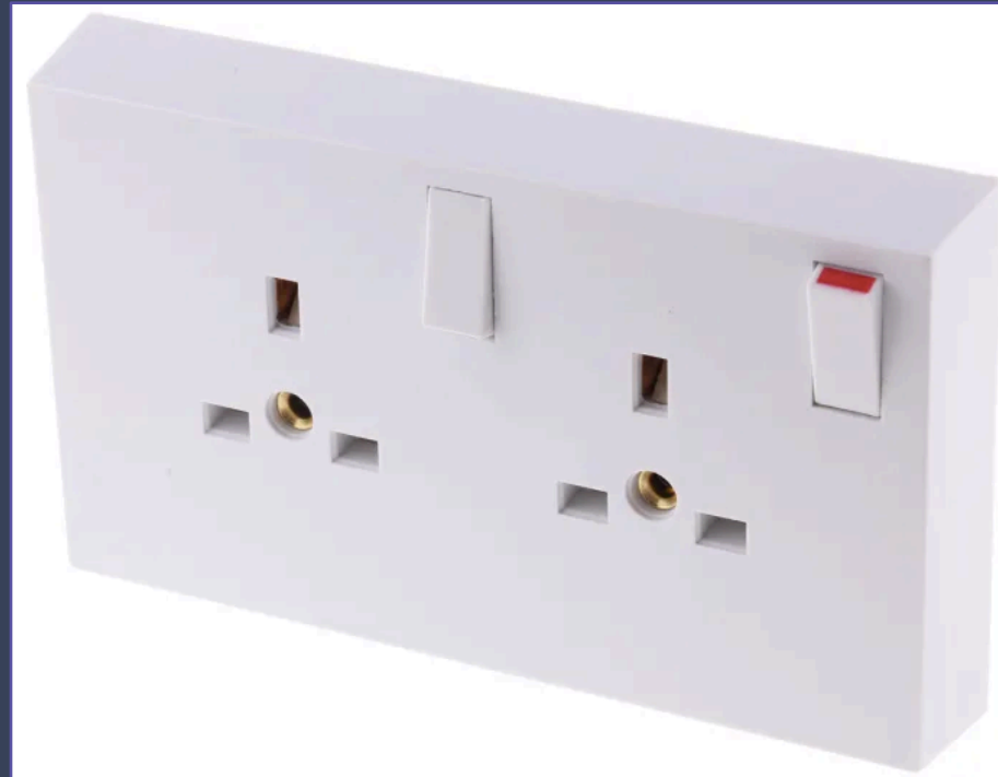
Additional 2x 13 amp Power sockets on stand: AED 558 / $ 151.94