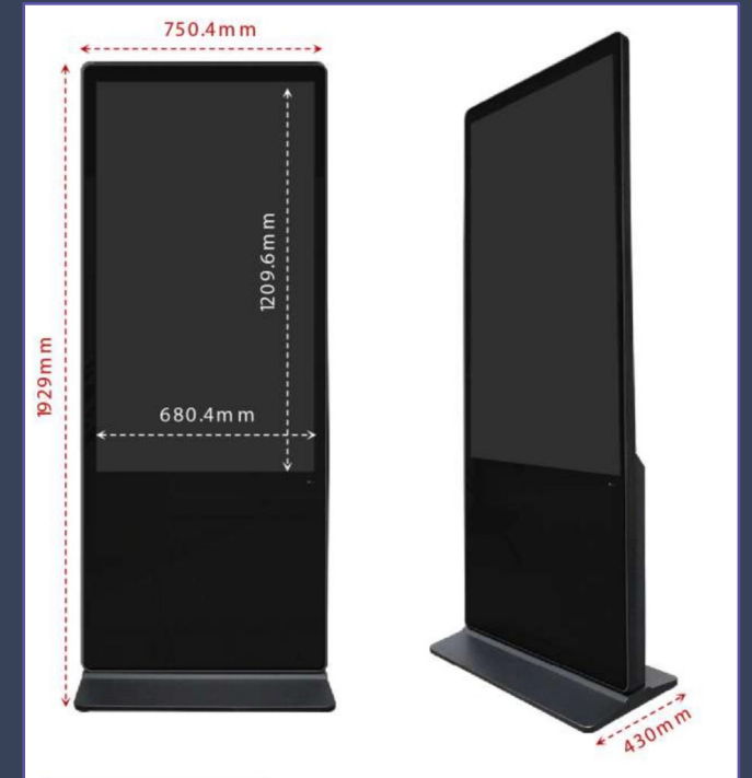
Free standing digital totem (2 day rental): AED 7,500 / $ 2,042.04 $