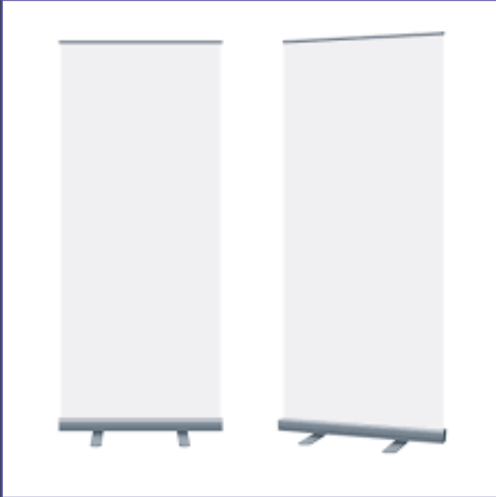
Pull Banner (excluding design): AED 500 / $ 136.15